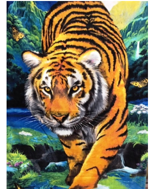
GREAT BEACH TOWEL for summer!

Our Nature's Vision fundraiser offers a wide variety of top quality environmentally themed products. These fashionable products will help promote environmental awareness at our school and in our community. Our school keeps 40% of the profit that will go towards offsetting field trip costs, assemblies, and other activities for students. Nature's Vision also donates to environmental organizations dedicated to protecting the Rainforest, preserving nature and ensuring a sustainable future for our planet.